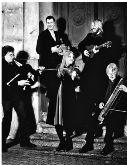
Iļģi Hamburg 2.8., Kiel 3.8. (page 27)

This year's country of focus "the Baltic states" is supported by the Departments of Cultural Affairs of Estonia, Latvia and Lithuania.