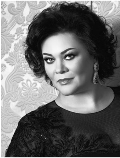
Violeta Urmana Lübeck 1.8. (page 25)