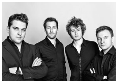
Signum Saxophone Quartet

K 75 Supported by Kulturinitiative Sandesneben-Nusse