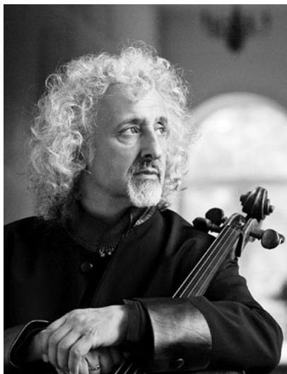
Mischa Maisky Elmshorn 10.8., Kiel 11.8. (page 35)

Today, the Schleswig-Holstein Musik Festival is among the largest classical music festivals in the world. Every summer, more than 130 concerts create a true tapestry of sound, stretching