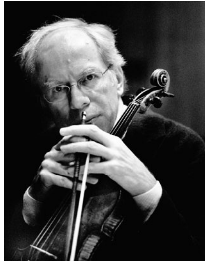
Gidon Kremer Haseldorf 9.7. (page 9), Kiel 24.7., Husum 25.7. (page 20)

across the entire region of Schleswig-Holstein and transforming it into one single, resonating body; from the North Sea to the Baltic Sea, from Flensburg to Haseldorf and from Lübeck to the island of Föhr. For seven weeks, world-famous orchestras, celebrated ensembles and virtuosic soloists bring the highest level of music to the people of Schleswig-Holstein and enjoy the open and warm-hearted atmosphere of northern Germany.