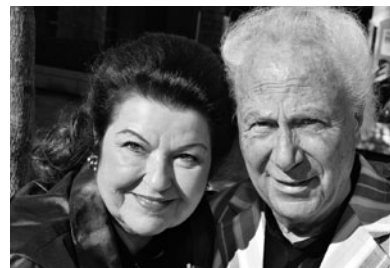
Helen and Klaus Donath

She was one of the very first festival artists; as the first concert of the very first Schleswig-Holstein Musik Festival took place at the Lübeck Dom on June 29, 1986, Helen Donath's delicate and soulful soprano voice reached the highest heights in Mozart's C minor Mass. After 27 years, this accomplished soprano is finally back at the SHMF. Together with her husband, pianist and conductor Klaus Donath, she tells of her riveting life and reflects on the most important stages of her musical career with selected vocal works and arias.