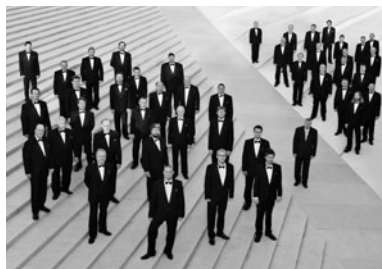
Estonian National Male Choir RAM

The Estonian National Male Choir RAM is currently the largest full-time professional male choir in the world. Founded in 1944 by the legendary composer and leader of the Estonian choral movement, Gustav Ernesaks, the choir has performed more than 6,000 concerts all across Estonia, the former Soviet Union, many Western European countries, Israel, Canada and the United States. The choir's repertoire ranges from the Renaissance Period to the music of the 21st century, and many Estonian and world-renowned composers such as Shostakovich, Bryars and Bonato have written music for it. In Plön the choir presents an entirely spiritual program.