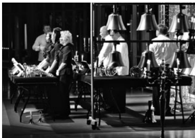
Arsis Handbell Ensemble

K 52 Supported by Ferring Arzneimittel GmbH Following the concert on Föhr, a chartered ferry has been arranged to Dagebüll.