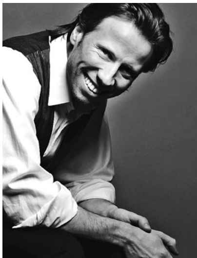
Kristjan Järvi Kiel 13.7., Elmshorn 14.7. (page 14)