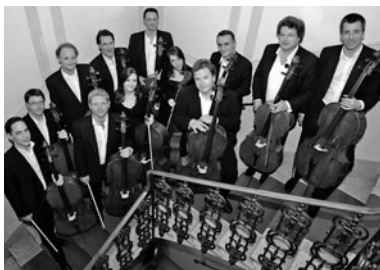
The 12 Cellists of the Berlin Philharmonic

K 84 Supported by Paul Albrechts Verlag and PAV CARD