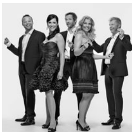
The Real Group

K 42 Supported by Timmendorfer Strand Niendorf Tourismus GmbH