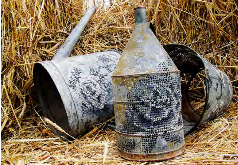
Severija Inčirauskaitė-Kriaunevičienė. Between the Town and the Country . 2008