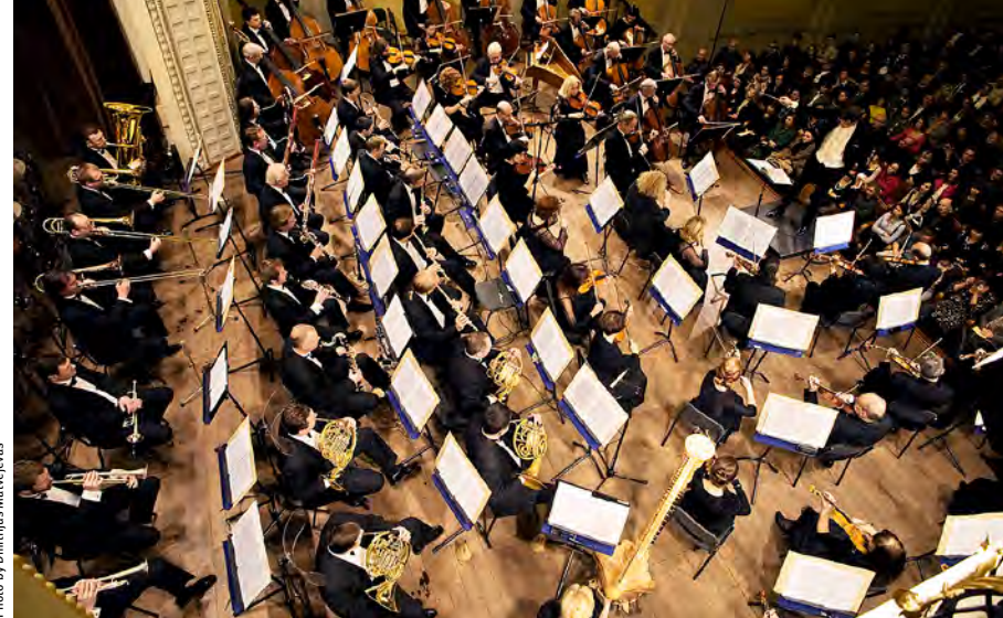
Lithuanian National Symphony Orchestra

www.kestutisvaiginis.com | www.labutis.lt