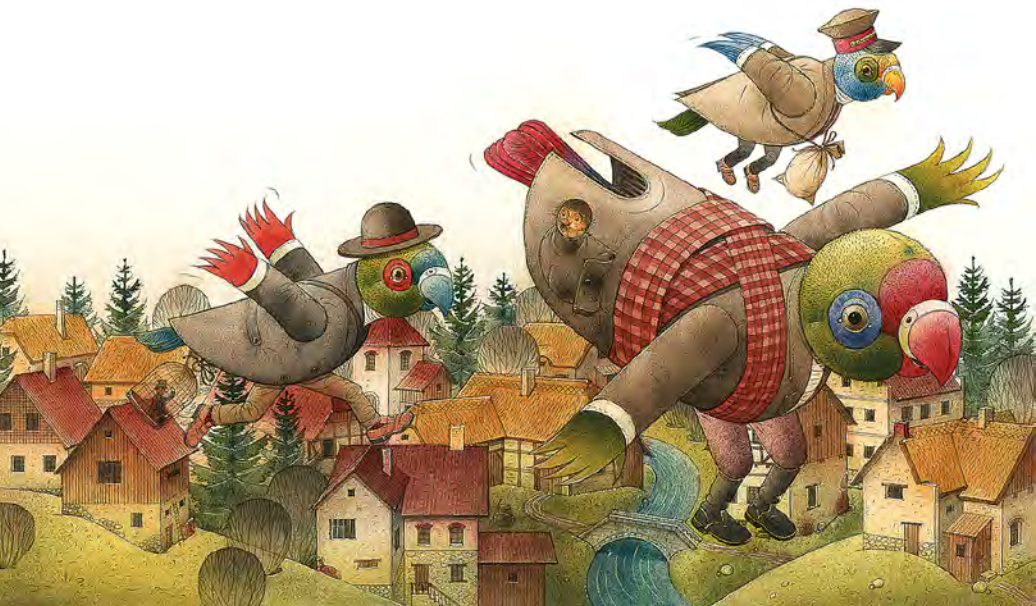
Illustration to the book The White Elephant by Kęstutis Kasparavičius. 2009