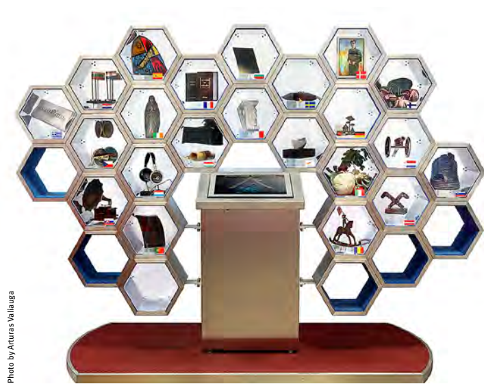
Lithuania in Europe. Europe in Lithuania

It's all in the mail, all you have to do is open the box.