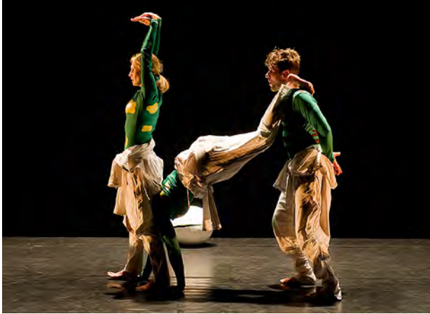
The Creation of the World