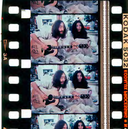
John Lennon and Yoko Ono's Bed-In , Montreal, Queen Elizabeth Hotel, May 26, 1969