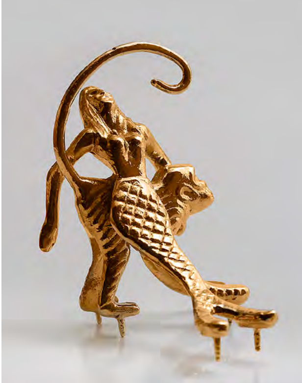
Marija Olšauskaitė. Cocktail Figures . 2011