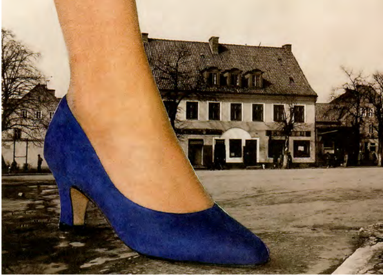
Artists' group Doooooris. The Prussian is Leaving . 1994