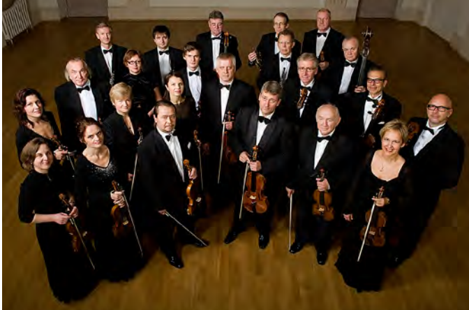
Lithuanian Chamber Orchestra