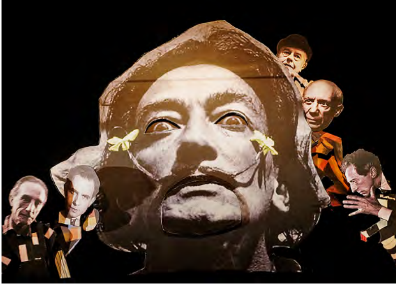
The Breasts of Teiresias