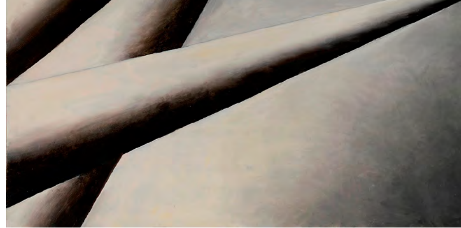
Kazys Varnelis. Last Shot . 2007–2008