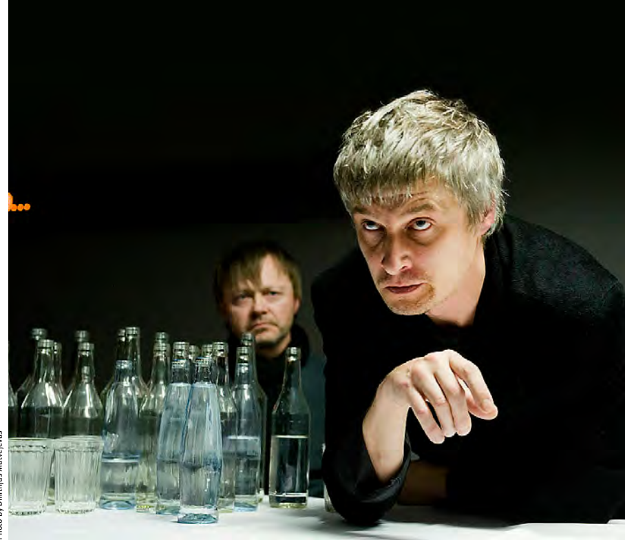
The Lower Depths