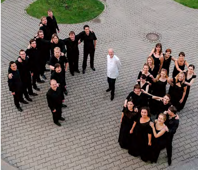
Gidon Kremer and Kremerata Baltica