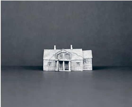
Indrė Šerpytė. 14 Bažnyčios Street Lentvaris