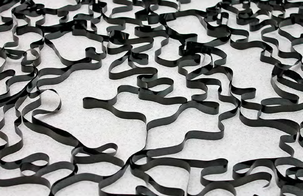
Žilvinas Kempinas. Fountains (detail). 2011