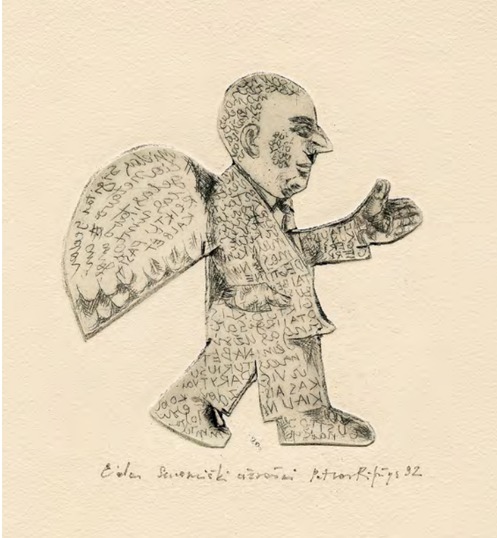
Petras Repšys. Finnish notes . 1992