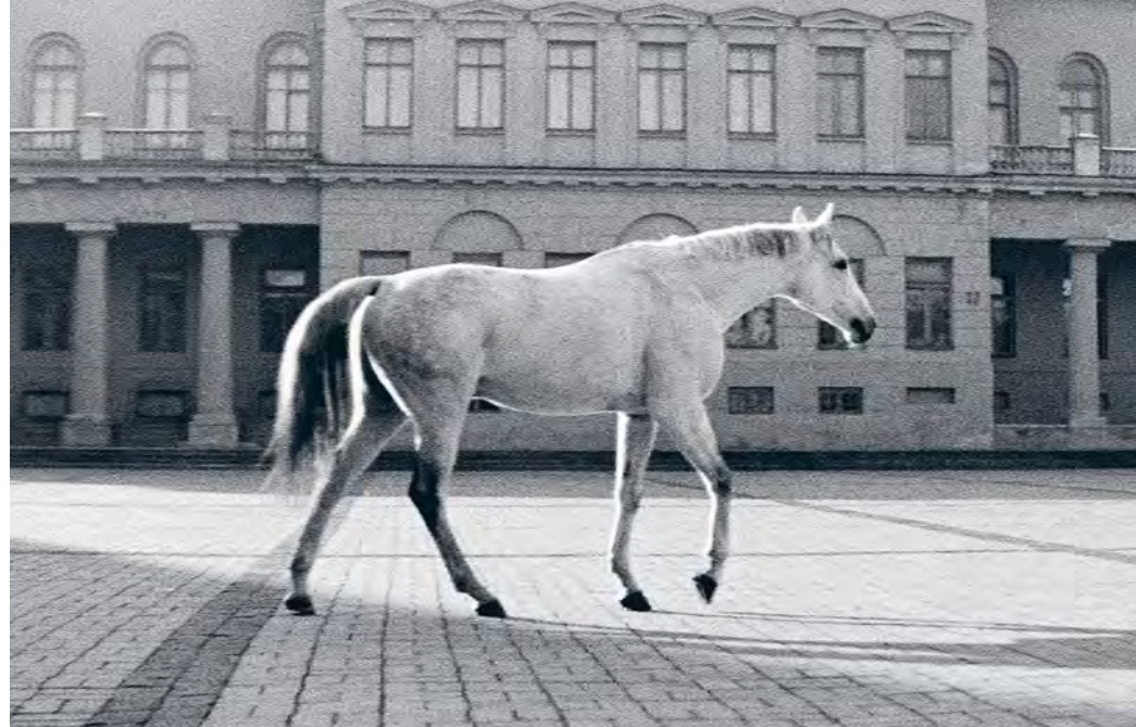
Film still from Time Passes through the City by Almantas Griekvičius, 1966

www.cinetecadibologna.it | www.museonazionaledelcinema.it www.univ-angers.fr | www.menoavilys.org