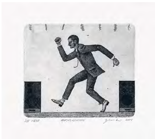
Evaldas Mikalauskis. One . 2001