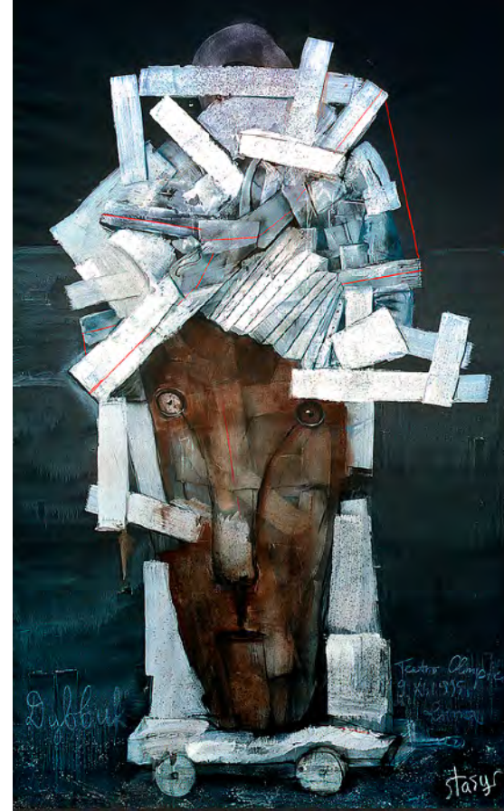
Stasys Eidrigevičius. Dybbuk . 1995