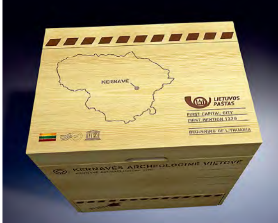
Lithuania in the Mail Parcel