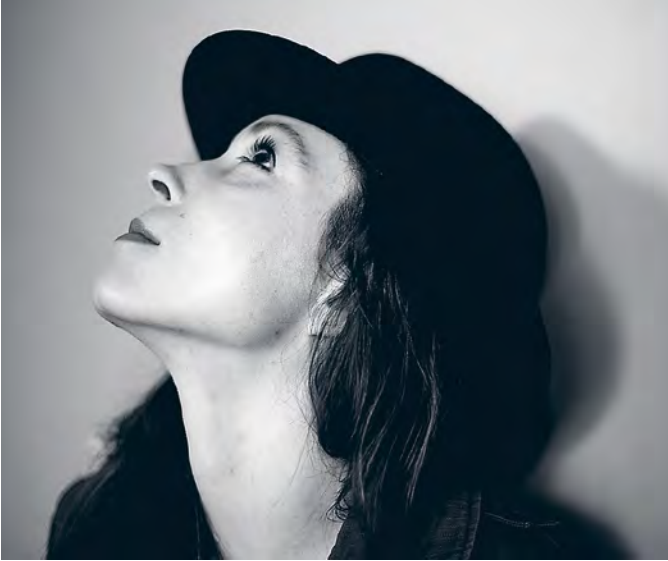
Poet Agnė Žagrakalytė