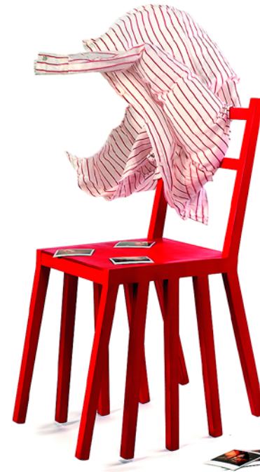
Paulius Vitkauskas. KU-DIR-KA chair

Lithuanian Presidency of the Council of the European Union