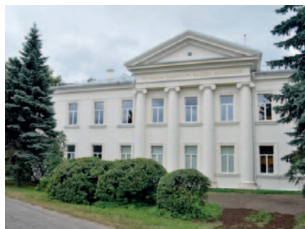
Vytautas Kasiulis Art Museum < Palace of Grand Dukes of Lithuania