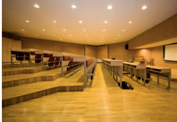
LAMT 2nd Building Room 227