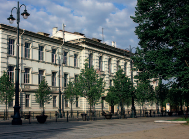
LAMT 1st Building